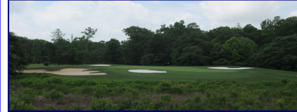
14th Hole at Lee's Hill Golf Club