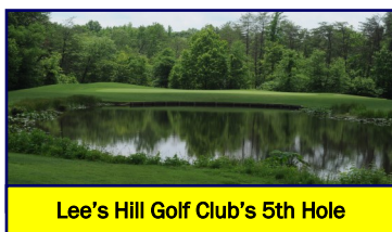
Lee's Hill Golf Club's 5th Hole