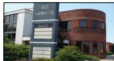
ERI Headquarters and Fredericksburg campus of The Gladys H. Oberle School.