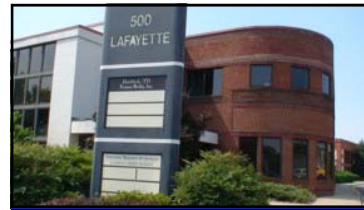
ERI Headquarters and Fredericksburg campus of The Gladys H. Oberle School.

Employment Resources Inc. & Gladys H. Oberle School 500 Lafayette Blvd., Suite 100 P.O. Box 801 Fredericksburg, VA 22404 Office: 540.372.6710 Fax: 540.373.1791 Hours: Mon.-Fri. 8am-4pm Web site: www.eri-va.com