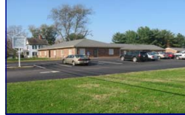
ERI Warsaw Campus & Office

Employment Resources Inc. Warsaw Campus & Office Chesapeake Office Bldg., Suite C 5559 West Richmond Road P.O. Box 403 Warsaw, VA 22572 Office: 804.313.2110 Fax: 804.313.2115 Hours: Mon.-Fri. 8am-4pm