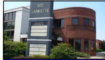
ERI Headquarters and Fredericksburg campus of The Gladys H. Oberle School.

Employment Resources Inc. & Gladys H. Oberle School 500 Lafayette Blvd., Suite 100 P.O. Box 801 Fredericksburg, VA 22404 Office: 540.372.6710 Fax: 540.373.1791 Hours: Mon.-Fri. 8am-4pm Web site: www.eri-va.com